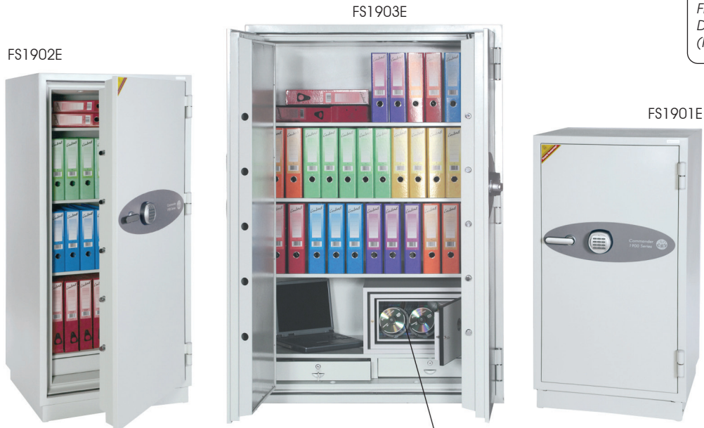
Shown with optional Data Protection insert (FSDPI03) for models FS1902E and FS1903E only.

Optional Extras Available Height adjustable shelves Suspended filing cradles Fingerprint lock Data Protection Insert (FS1902E & FS1903E only)